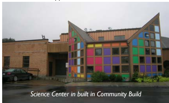
Science Center in built in Community Build

I was not allowed to take interior pictures because of the children present, but I did take a couple shots from the outside. See for yourself what the possibilities are! We WILL make this happen!